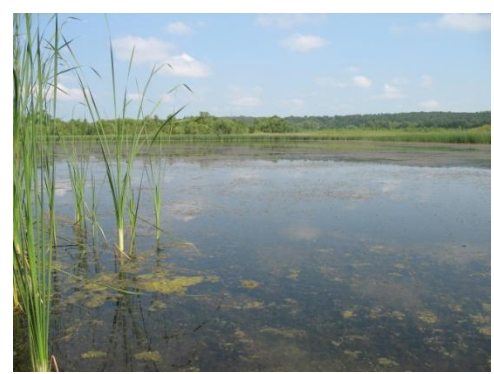
Fig. 2: Wetland restoration