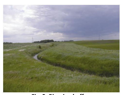
Fig. 3: Riparian buffer